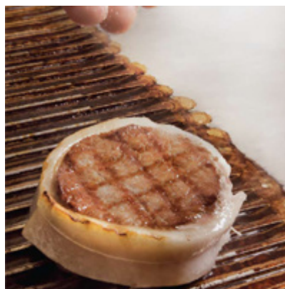
The Grilling Process