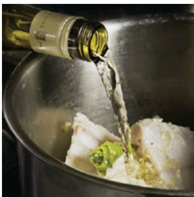
Fumet de Poisson